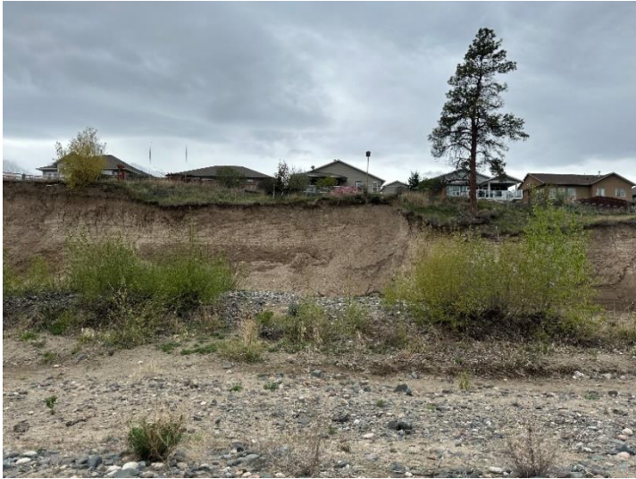
FIGURE 3 – COLDWATER RIVER EMBANKMENT ALONG FIR AVE