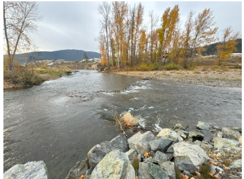
FIGURE 6 – DOWNSTREAM EXTENT OF PROJECT AREA