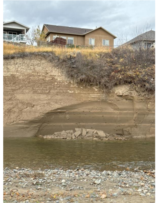
FIGURE 4 - EMBANKMENT SLOUGHING INTO THE COLDWATER RIVER