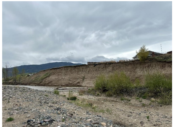
FIGURE 2 – COLDWATER RIVER EMBANKMENT ALONG FIR AVE