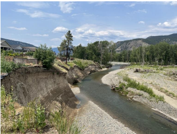
FIGURE 5 – EMBANKMENT EXTENDS ALONG COLDWATER RIVER