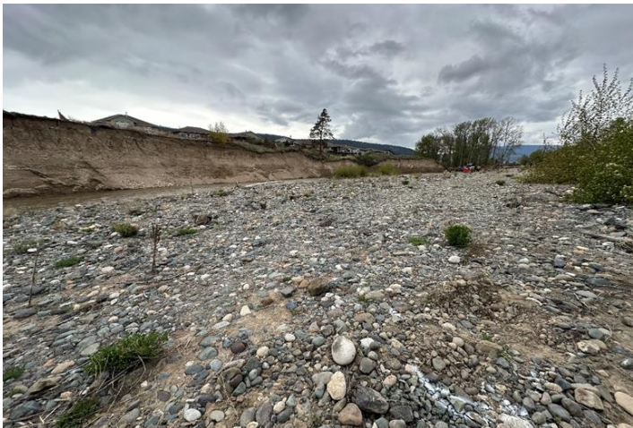
FIGURE 1 – CHANNEL WIDENING AREA