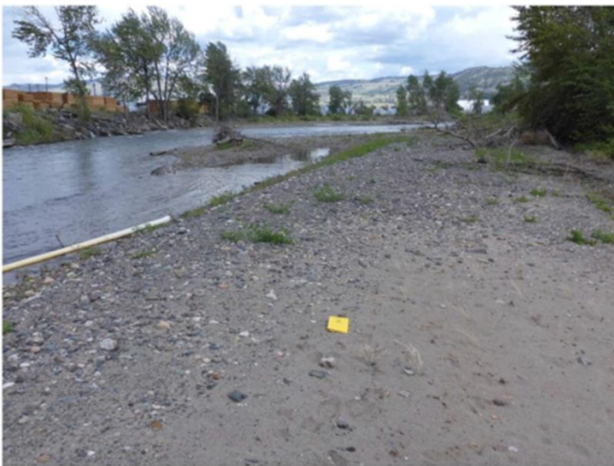
FIGURE 5 – TYPICAL BAR AREA WHERE PLANTING IS PROPOSED