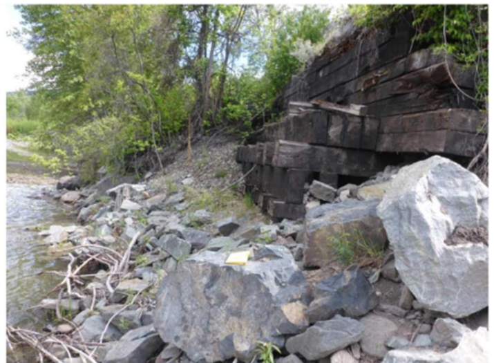
FIGURE 6 - RAILWAY CROSSING ABUTMENT TO BE REMOVED