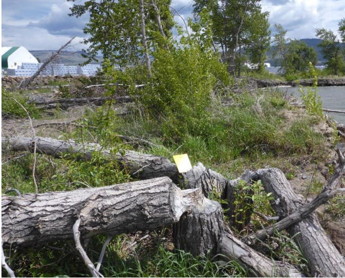
FIGURE 3 – EXISTING BEAVER DAMAGE TO COTTONWOODS