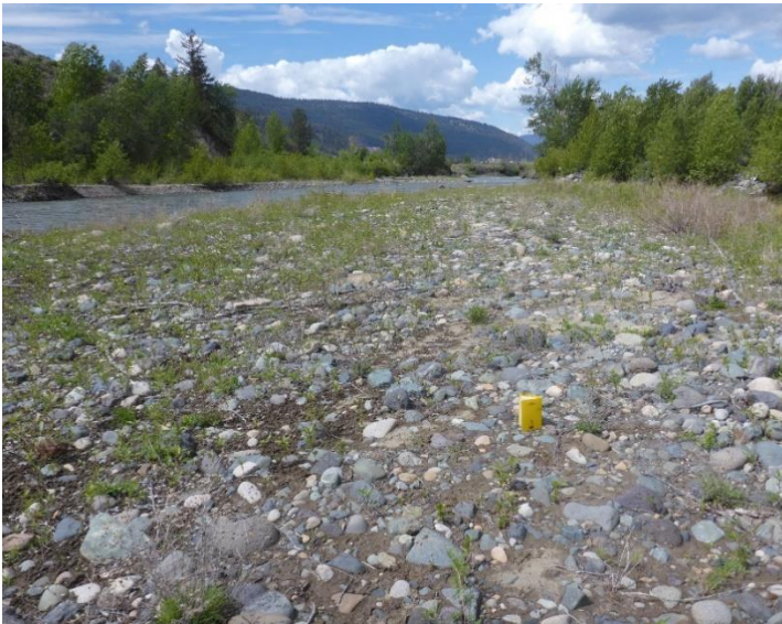
FIGURE 1 – TYPICAL AREA FOR BAR PLANTING