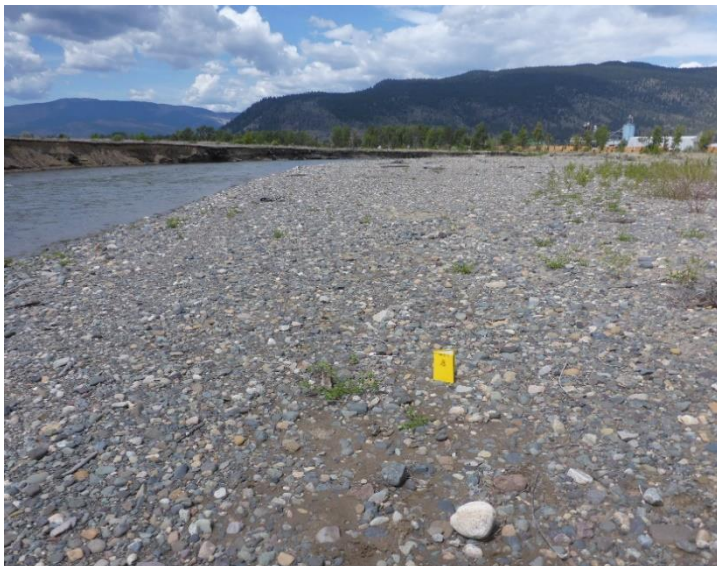
FIGURE 2 – TYPICAL AREA FOR BAR PLANTING