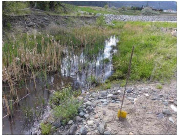
FIGURE 4 – PROPOSED OFF CHANNEL HABITAT CREATION AREA