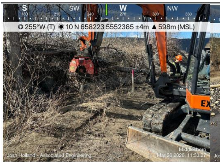
Figure 1 – planting method (stinger)